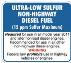
EPA 40 CFR 80.572(b) and 80.573(a)