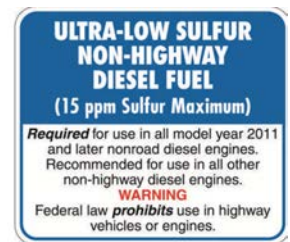
EPA 40 CFR 80.572(b) and 80.573(a)